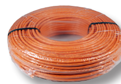
100 m ring